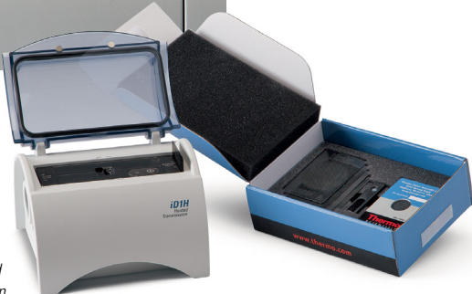
iD1H Heated Transmission Optional Accessory

Based on the popular Thermo Scientific Nicolet iS5 mid-infrared spectrometer, the Nicolet iS5N FT-NIR spectrometer integrates high-performance optics into a small, rugged package. The spectrometer is perfect for use in a wide range of settings, from small industrial facilities to global manufacturing sites.